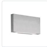
AT6610-BN-UNV Brushed Nickel